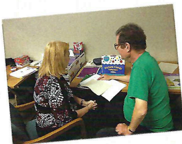
One stroke survivor helps another read.