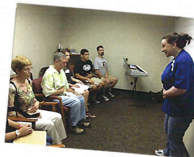
Pilot music therapy program.