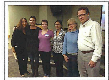
ASL students speak at AAASLP.

In 2013 Austin Speech Labs hopes to accomplish the following: